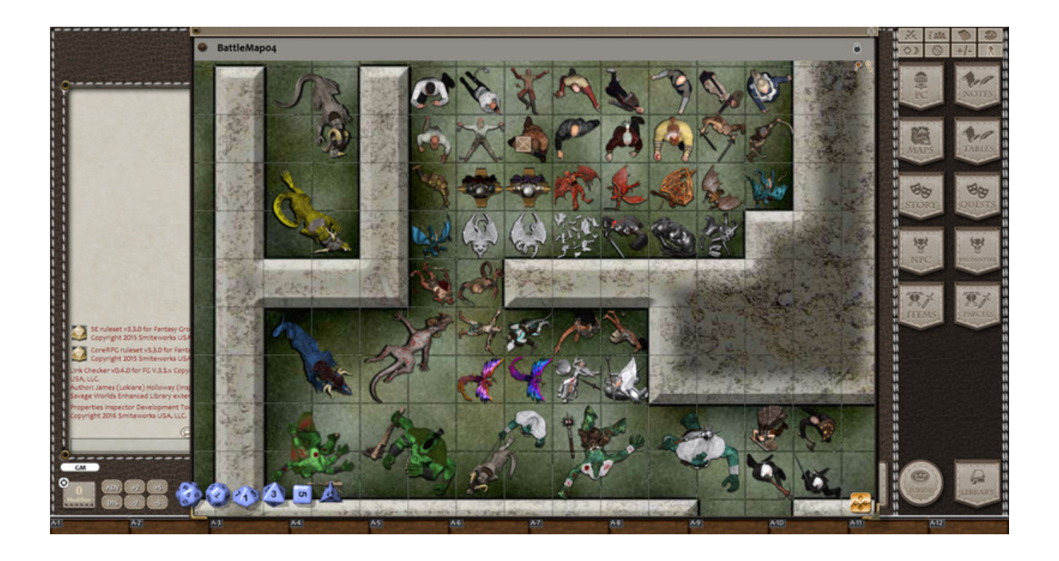
Fantasy Grounds - Ddraig Goch's Tyranny 7 (Token Pack) Activation Code [License]